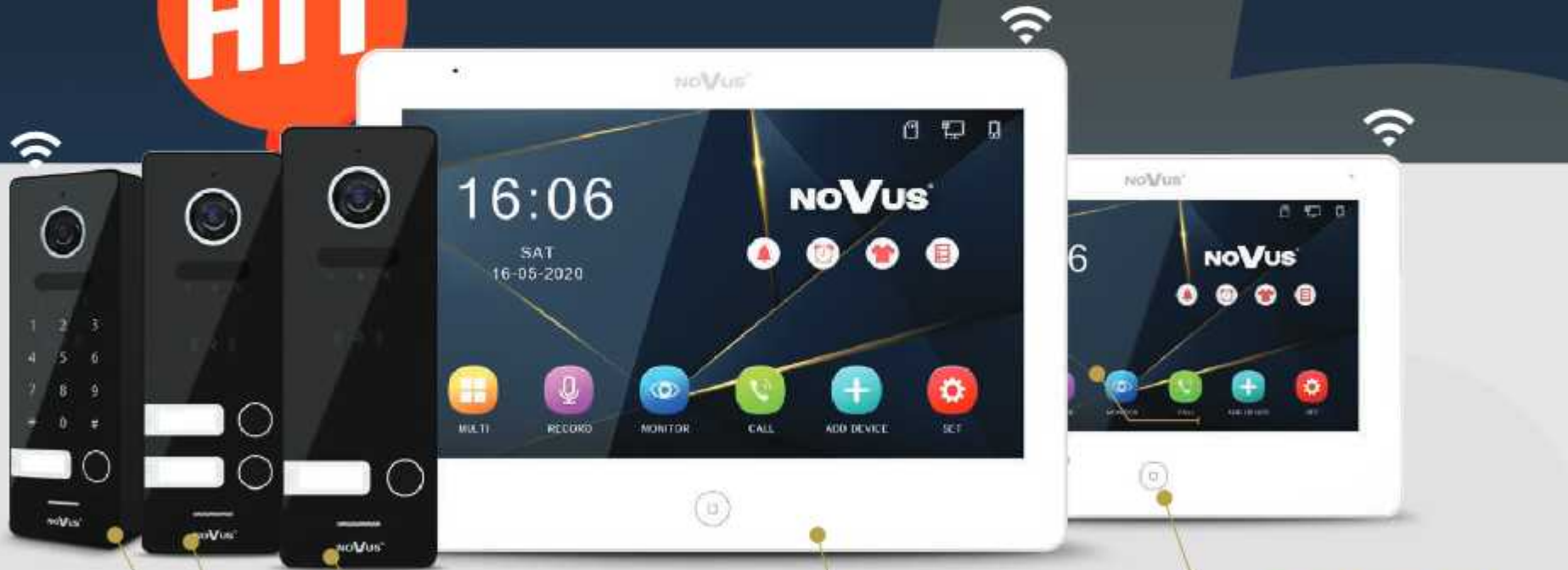
NVE-EPV101KPWIFI ONE-BUTTON IP ENTRANCE PANEL WITH WI-FI