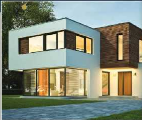
single-family houses with belonging business