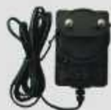
NVE-PV100 Power supply