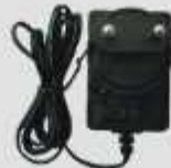
NVE-PV100 Power supply